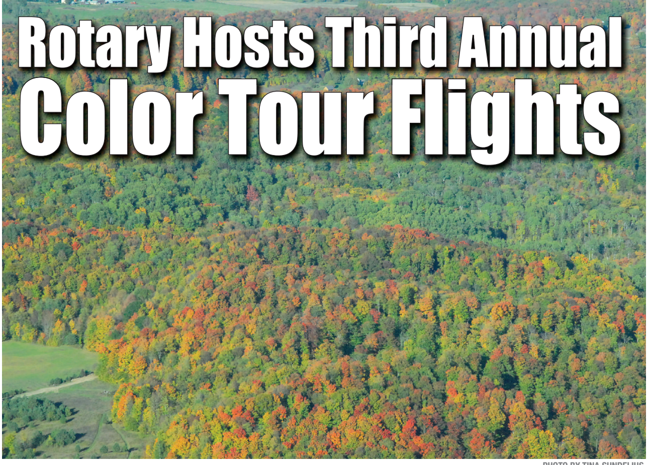
ABOVE: This photo, taken over the Jordan Valley on Oct 1st, shows the evergreen cedars that line the Jordan River's banks and the dense woodlands of the valley almost to peak colors. The East Jordan Rotary Color Tours on Oct 8 should allow color peepers the most dynamic viewing.