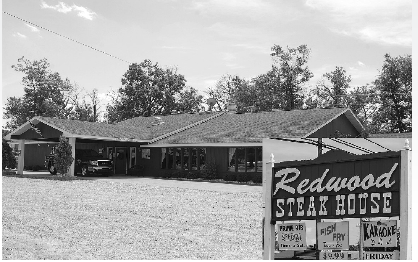
For over 50 years, the Redwood Steak House in Lewiston has offered a unique, steak house (and seafood) experience right here in northern Lower Michigan.