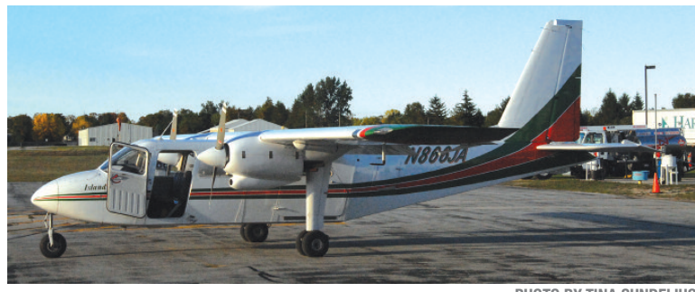
One of the twin-engine planes Island Airways in Charlevoix is providing for use during the East Jordan Rotary Color Tours on Saturday, Oct 8. "Island Airways generously supports the Airplane Color Tour fund raising activity in East Jordan," said Jim Slough, one of the pilots hosting the tours. Proceeds are used for local student education assistance, scholarships, and international projects such as polio eradication.