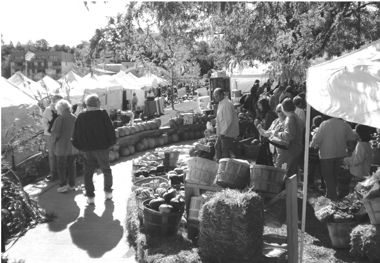
Friday, October 14th marks the beginning of the 33rd annual Charlevoix Apple Festival, a weekend-long celebration of the autumn harvest season.

Fall is in the air, which means that northern Michigan orchards are busy harvesting bushels of fresh, ripe apples in preparation for the 33rd Annual Apple Festival taking place downtown Charlevoix on October 14-16. The Apple Festival is held yearly to support our local orchards and growers who, in the spirit of the season, line Bridge Street to bring the fall harvest to you.