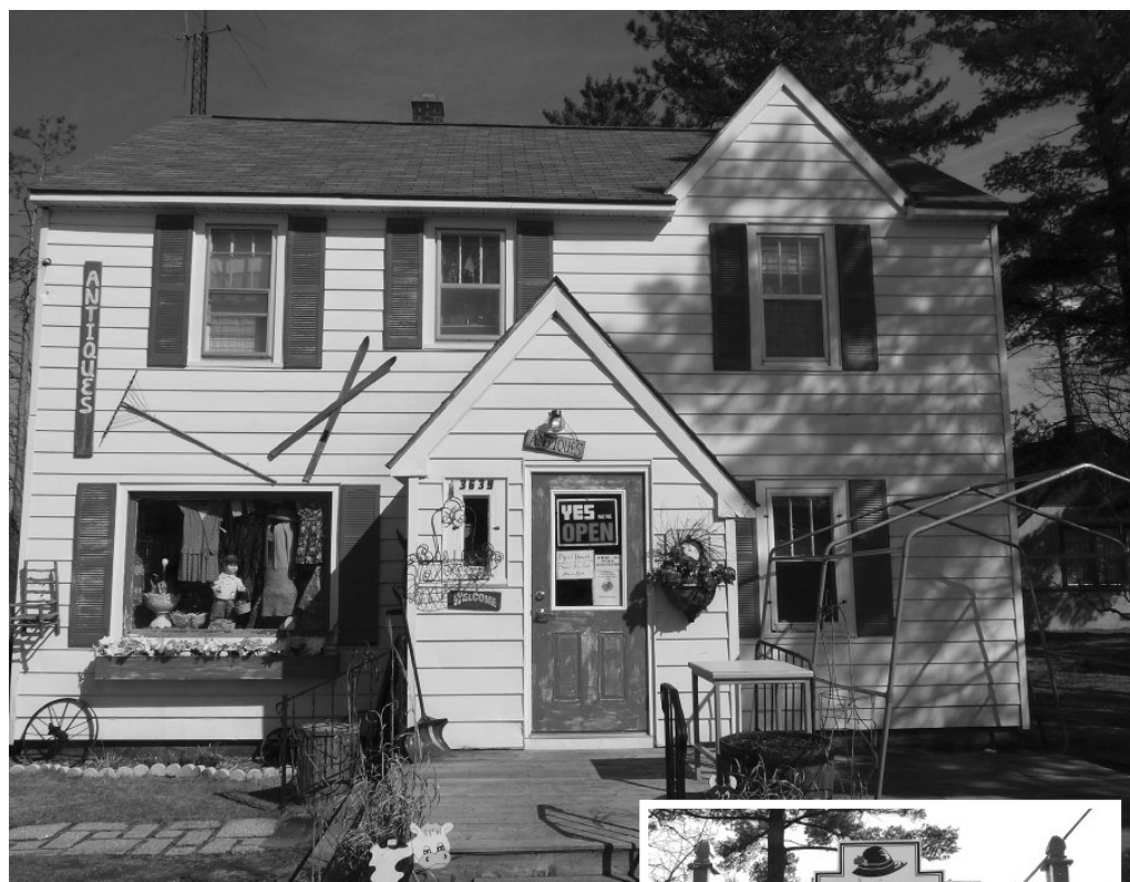
For additional information call (231) 238-5000 or visit finderskeepersconsignment.net

Finders Keepers Antiques & Consignment Shop is located at 3639 S. Straits Highway in Indian River, and is open Tuesday, Thursday and Friday from 10 am to 5 pm, and from 10 am to 4 pm on Saturday.